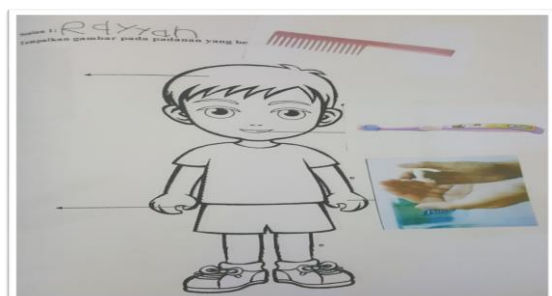
Figure 2 : attempted to write name and able to match correctly