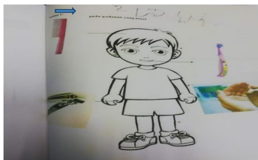
Figure 1 : unable to write name but able to match correctly

The researchers found the study useful for children under 6 years of age. It is able to educate these children to engage in the importance of their level of personal hygiene. Pedagogy Theatre allows the children to warm up and be impulsive as well as to share their own ideas. The children shared their thoughts on wanting to meet/ play with their super heroes (Ultraman, Iron man) after having brushed their teeth and the researchers found this to be of positive outcome of the study as the children have expressed a desire to be clean for someone they like. The children were able to answer were able to answer the worksheet correctly although some are not able to read or write their own name.